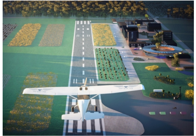
Living aerospace laboratory rendering by Paradox